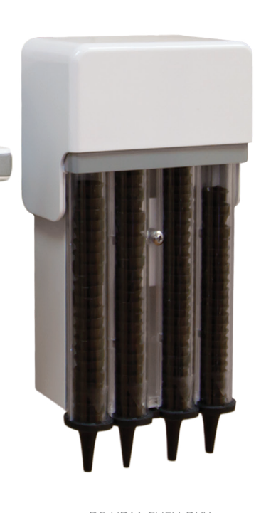
Part Number: DS-UDM-CHFH-DXX